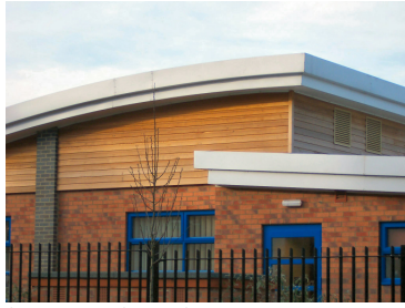
Surestart – South Shields