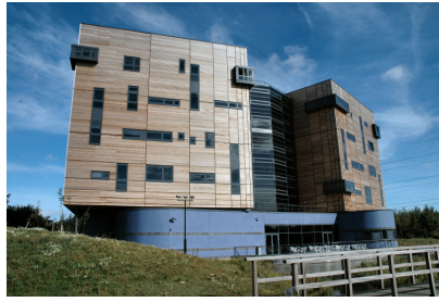
Quadrus Business Centre – Boldon