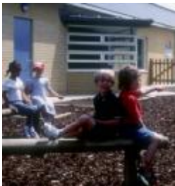
Oldbrook First School ~ Milton Keynes