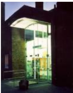
Buckinghamshire County Council Museum