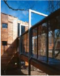
The Trinity School, Newbury, Berkshire