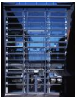
The John Bright High School ~ Llandudno, N.Wales