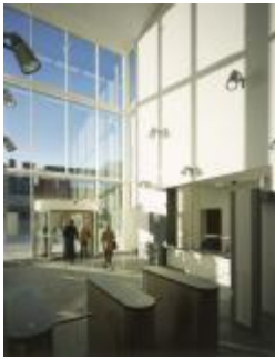
Exeter Crown & County Courts ~ Reception