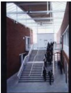
Shenley Brook End School ~ Milton Keynes

We also enjoy many individual commissions either for consultancy or design and can bring our considerable experience across all professions of the demands of creating and renewing public buildings. These commissions are becoming increasingly specialist and our early involvement in PFI, DDA assessment, Asset Management, contractor partnering and M4I projects places us in a strong position to support clients in their new initiatives.