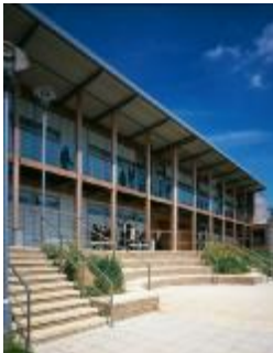
Highcrest Community School, High Wycombe