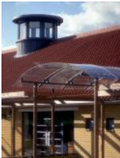
Glastonbury Thorn First School ~ Milton Keynes