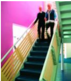
The Buckingham Upper School ~ internal