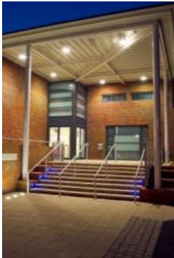
The Buckingham Upper School, Buckinghamshire.