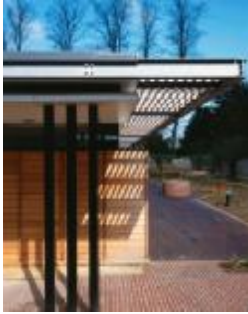
Wendover House School, Aylesbury, Buckinghamshire.