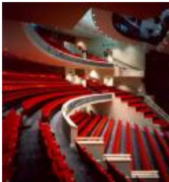
The Wycombe Swan Theatre Auditorium