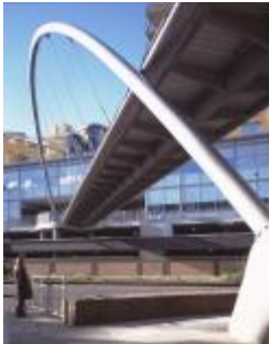
Churchill Way Bridge