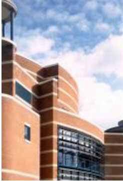
The Wycombe Swan Theatre