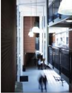
The John Bright High School ~ Llandudno, N.Wales