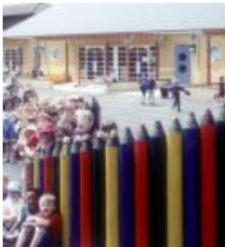
Oldbrook First School ~ Milton Keynes