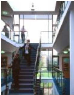
The Trinity School ~ Internal