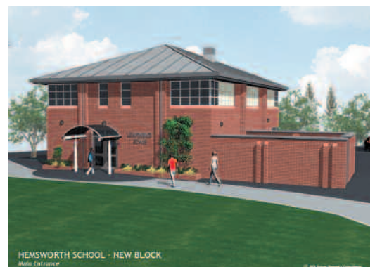
Artists impression of new Social and Learning Block at Hemsworth Arts & Community College

NPS Property Consultants are providing architectural, structural, mechanical and electrical engineering, CDM and quantity surveying services from the company’s North West (Wigan) office in conjunction with their North East (Normanton) office. Works commenced on site mid May with an estimated completion of December 2007. ■